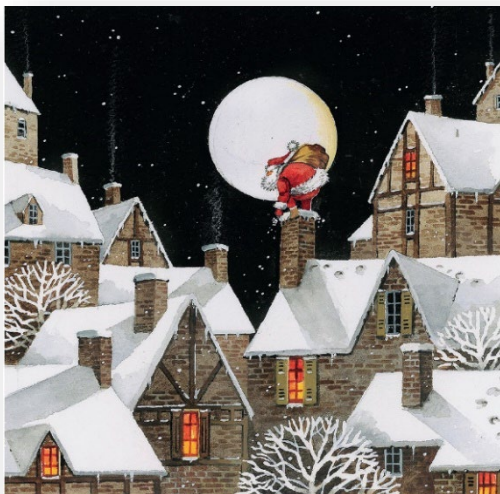
Santa on the Rooftops