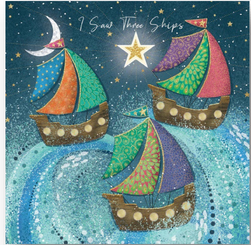
I Saw Three Ships (B)