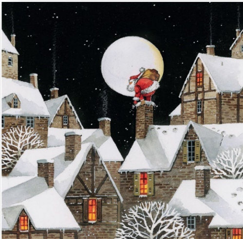
Santa on the Rooftops (C)