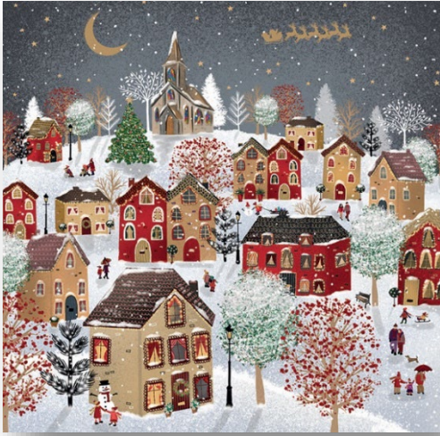
Christmas Eve Village (A)

Registered Charity 1167610 (England & Wales)