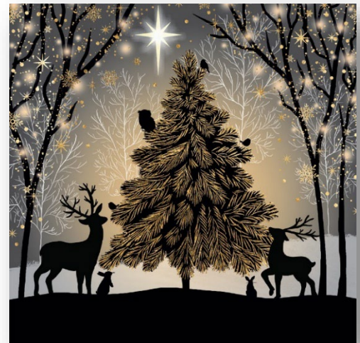
Twinkly Golden Forest (D)

We are also offering 'Lucky Dip' packs of cards from stocks we have left over from previous years, these are priced at £3.00 for a pack of 10