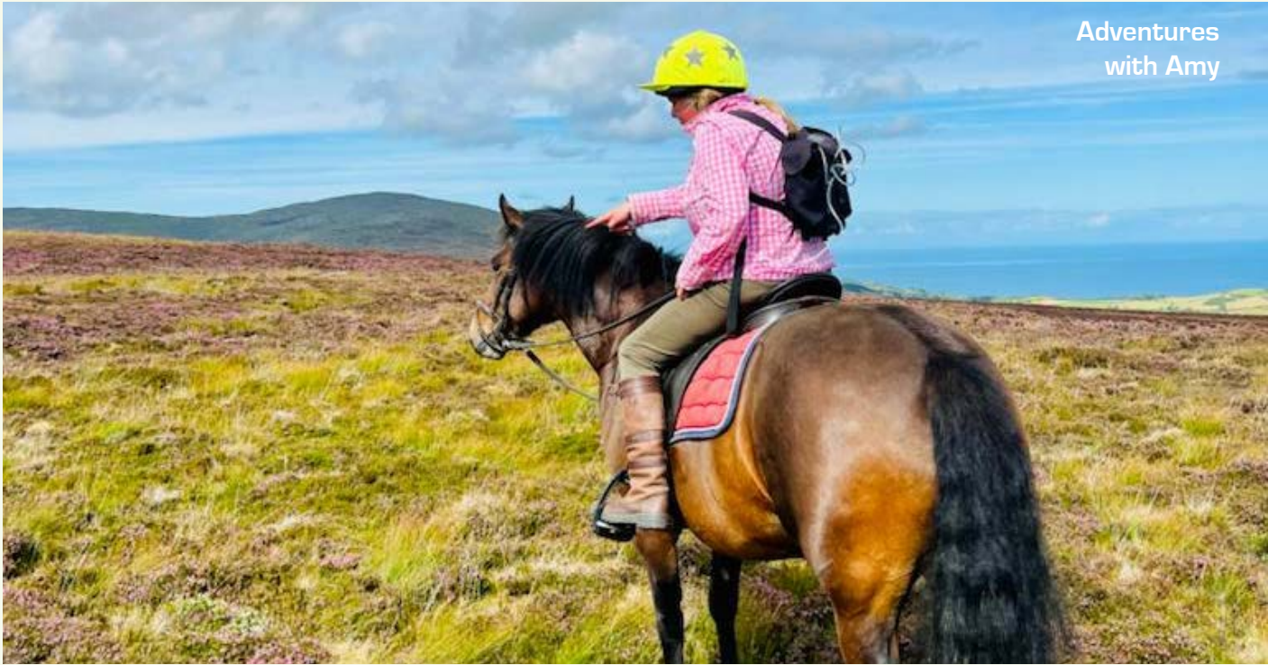
Adventures with Amy