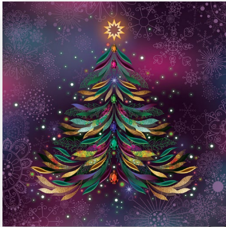
Ornate Christmas Tree (A)

Registered Charity 1167610 (England & Wales)