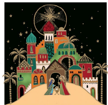
Midnight Bethlehem (E)

We are also offering 'Lucky Dip' packs of cards from stocks we have left over from previous years, these are priced at £3.00 for a pack of 10