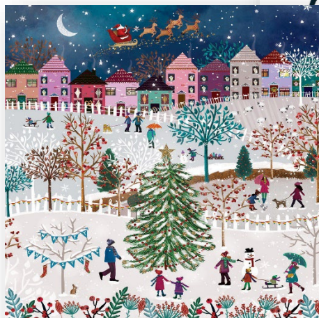
Christmas Eve Together (D)