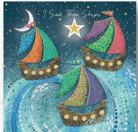
I Saw Three Ships (B)