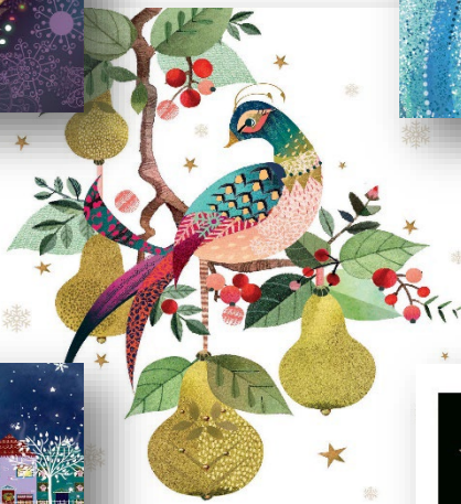
Christmas Partridge (C)